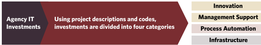
FIGURE 1. AGENCY IT INVESTMENT DISAGGREGATION PROCESS

get years for the 30 departments and agencies used in the study (OMB, 2009c). Again, the study used the mean of 2 reporting years to better accommodate any spikes in one type of investment in a given year. This study allocated over 7,200 17-digit coded investments in a total of 30 federal government agencies, based on project descriptions and codes, according to the four investment allocation categories of Innovation, Management Support, Process Automation, and Infrastructure. These categories are similar to the four categories described in Weill and Aral (2003): Strategic, Informational, Transactional, and Infrastructure, but adapted to better describe Exhibit 53 categories. Total IT investments were disaggregated into these four IT investment categories, as shown in Figure 1.